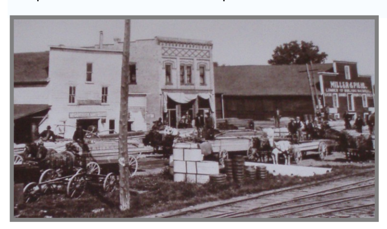
In the early 1900's Depot St. was a busy place. Notice the present museum with the distinctive contrasting brickwork. Few business buildings from prior to 1900 remain.

The Miller-Piehl Building, constructed in 1893-94, is one of the oldest commercial buildings in Seymour. At one time Depot St. was a busy commercial hub with as many as eight trains a day going through the city. Many of them carried supplies to and from the lumber and coal company that occupied the entire north side of Depot St. from Main to Mill St.